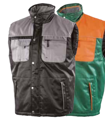
27.984.0 TESLA // WORKER VEST S - 4XL