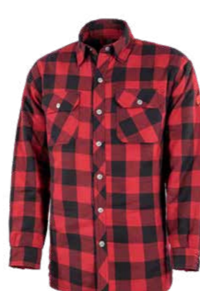
29.210.0 TILER // THERMOSHIRT S - 3XL