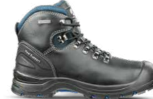
63.175.0 X-TREME CTX MID S3 WR HRO SRC Sizes: 39 - 47