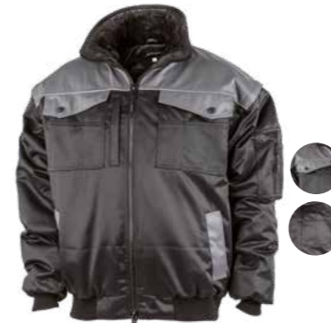
27.200.0 ALLROUNDER // PILOT JACKET 2 IN 1 S - 4XL