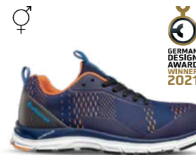
64.751.0 AER55 IMPULSE BLUE ORANGE LOW S1P ESD HRO SRA Sizes: 36 - 47