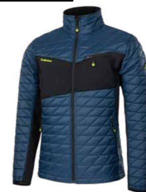
26.706.0 CONCEPT JACKET // QUILTED JACKET S - 3XL