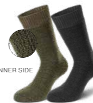
SOFT INNER SIDE 24.080.0 THERMO CONTROL SH // SHORT BOOT SOCK Sizes: 39/41, 42/44, 45/47, 48/52