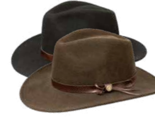
25.792.0 BOGART // WOOLFELT HAT Sizes: 55/56 - 61/62