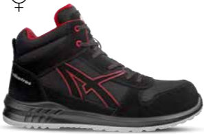
63.870.0 CLIFTON MID S3 SRC Sizes: 36 - 47