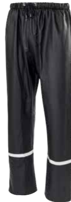
27.452.0 FORECAST TRS // PU-STRETCH-RAIN TROUSERS S - 3XL