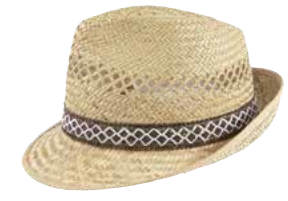
25.505.0 TRILBY // STRAW HAT Sizes: 54 - 61