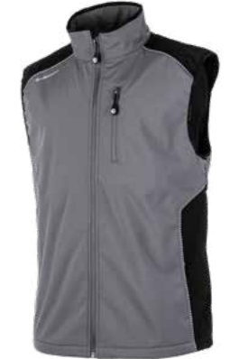
28.665.0 EXPERT 360° // SOFTSHELL VEST S - 3XL