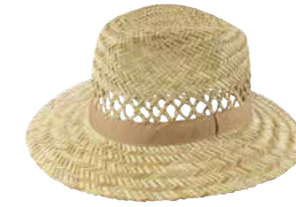
25.530.0 HARVESTER // STRAW HAT Sizes: 55/56 - 61/62