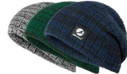
25.524.0 POLARGUARD // KNITTED CAP ONLY IN ASSORTMENS: 10 PIECES 4 pieces grey-black, 4 pieces blue-black & 2 pieces green-black