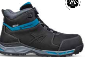
63.850.0 TOFANE BLACK QL CTX MID S3 WR ESD HRO SRC Sizes: 40 - 47