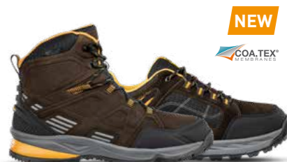
67.671.0 | 65.670.0 LOFOTEN 2.0 BROWN CTX MID | LOW Sizes: 40 - 46