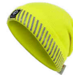
25.525.0 HIVIS THERMO // KNITTED CAP ONLY IN ASSORTMENS: 10 PIECES