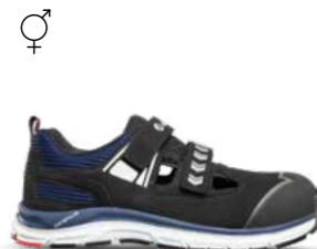
64.753.0 JETSTREAM IMPULSE LOW S1 ESD HRO SRA Sizes: 36 - 47