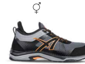
64.629.0 STUNNING LOW S1P ESD HRO SRC Sizes: 36 - 47