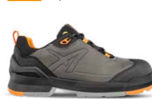
64.802.0 TARAVAL GREY LOW S3L ESD FO SR Sizes: 36 - 47