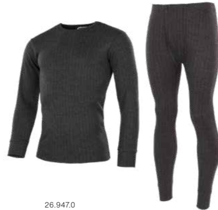
26.947.0 THERMOGETIC LA // THERMO-FUNCTIONAL SHIRT Sizes: S - 2XL (5 - 9)