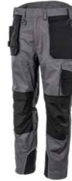
CORDURA YKK 28.662.0 EXPERT 360° // TROUSERS 24 - 27, 48 - 58