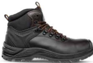
63.132.0 ENDURANCE MID S3 SRC Sizes: 39 - 47