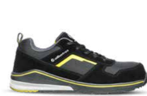
64.760.0 COURT BLACK LOW S3 ESD HRO SRC Sizes: 39 - 48