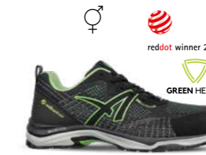
64.630.0 SPELNDID GREEN GH LOW S1P ESD HRO SRC Sizes: 36 - 47