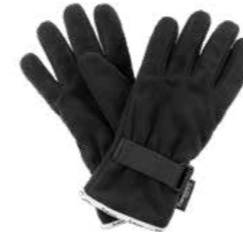
25.066.0 ICEBREAKER // MIKROFLEECE-GLOVES Sizes S - 3XL