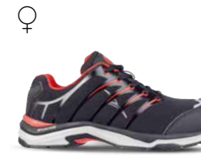
64.521.0 TWIST RED WNS LOW S1P ESD HRO SRC Sizes: 36 - 42