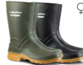
56.402.0 | 56.404.0 GUARDIAN MID GREEN | BLACK NITRILE RUBBER BOOT Sizes: 36 - 48