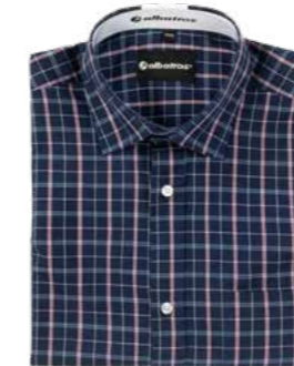
29.041.0 BRONZE 1/2 // SHORT SLEEVE SHIRT 39/40 - 49/50