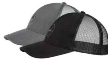
25.423.0 POWER // SOFTSHELL-BASEBALLCAP ONLY IN ASSORTMENS: 10 PIECES/COLOUR