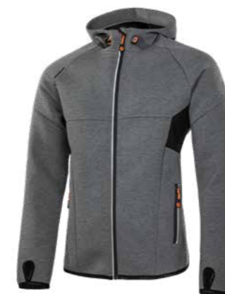
26.419.0 KOLARI // SWEATSHIRT-JACKET S - 3XL