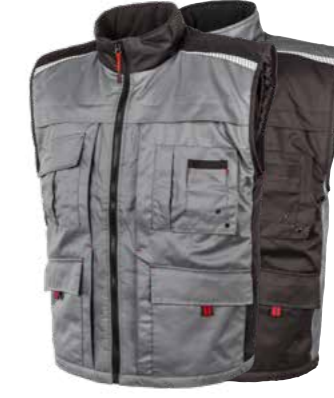
27.931.0 EDISON // WORKER VEST S - 4XL