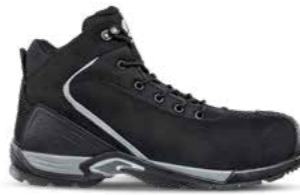
63.169.0 RUNNER XTS MID S3 HRO SRC Sizes: 39 - 47