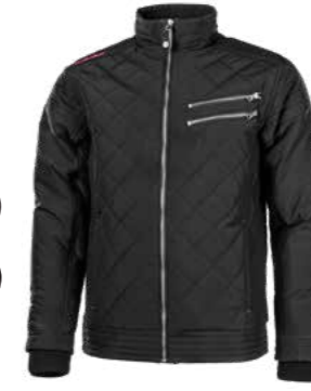
27.059.0 PIZZARO // JACKET S - 3XL