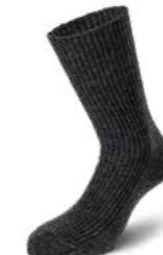
24.093.0 ARCTIC WOOL // SHEEP'S WOOL SOCK Sizes: 39/40, 41/42, 43/44, 45/46, 47/48