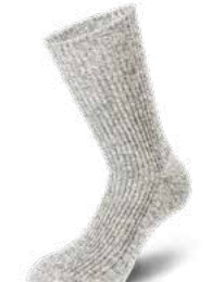
24.092.0 NORWEGER SH // NORWEGIAN SHORT SOCKS Sizes: 39/40, 41/42, 43/44, 45/46, 47/48