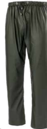
27.446.0 FAHRENHEIT TRS // PU-STRETCH-RAIN TROUSERS S - 3XL