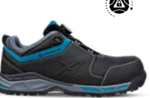
64.851.0 TOFANE BLACK QL LOW S3 ESD HRO SRC Sizes: 40 - 47