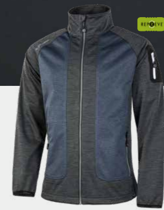
26.471.0 KINGSLEY // RECYCLING JACKET S - 3XL