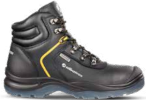
63.112.0 GRAVITY CTX MID S3 WR SRC Sizes: 39 - 48