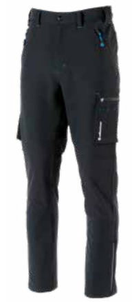
28.105.0 SKILL 4D TRS // STRETCH-TROUSER S - 3XL