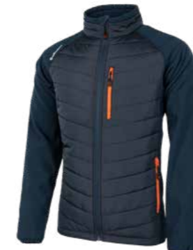
26.705.0 PARRY // QUILTED JACKET S - 3XL