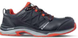
64.620.0 ULTRATRAIL BLACK LOW S3 ESD HRO SRC Sizes: 36 - 47