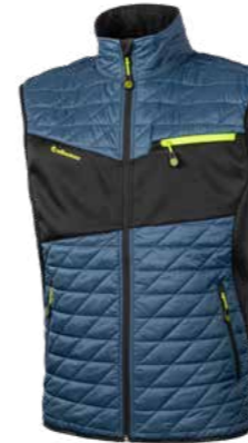
27.705.0 CONCEPT VEST // VEST S - 3XL