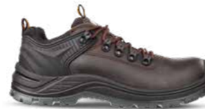
64.135.0 ENDURANCE LOW S3 SRC Sizes: 39 - 47