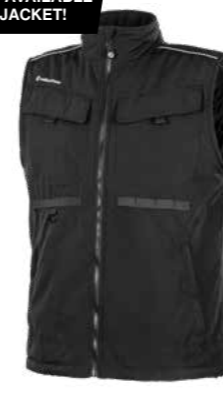
27.976.0 TIBER // WORKER VEST S - 3XL