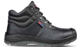
63.190.0 SOLID MID S3 SRC Sizes: 39 - 47