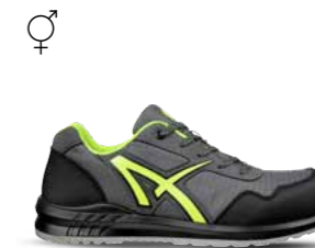
64.873.0 DRIFTER GREEN LOW S1P SRC Sizes: 36 - 47