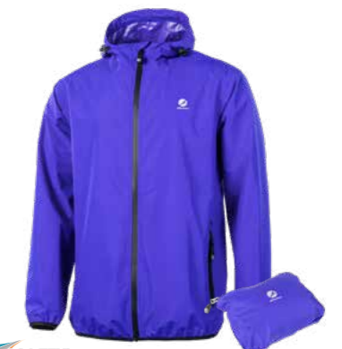
COA.TEX MEMBRANES 27.547.0 WRAP ME CTX // RAIN JACKET M - 2XL