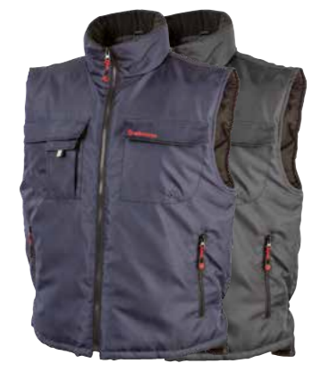
29.975.0 HERTZ // WORKER VEST S - 4XL