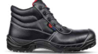
63.180.0 COMPACT MID S3 SRC Sizes: 36 - 48