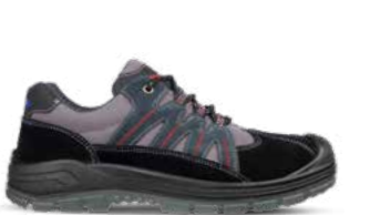
64.187.0 INNOVATIVE LOW S1P SRC Sizes: 39 - 47