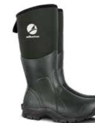
57.554.1 ONYX 2.0 NEOPRENE BOOT Sizes: 39 - 47