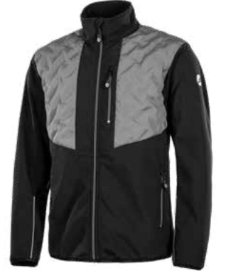
26.709.0 WICKLOW // HYBRID JACKET S - 3XL