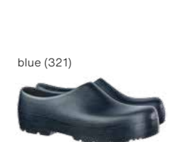
55.025.0 PURCEL PROFI GARDEN CLOG Sizes: 36 - 47