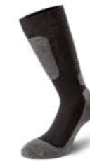
24.031.0 SAFE & SOFT // ALLROUND SOCK Sizes: 39/42, 43/46