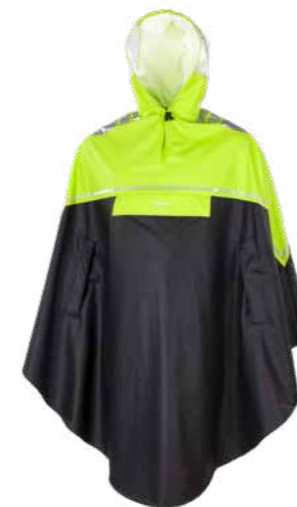
27.544.0 CYCLONE // RAIN CAPE M/L