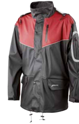
27.477.0 CLIMATE JKT // PU-STRETCH RAIN JACKET S - 3XL