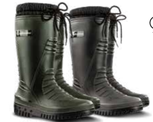
59.018.0 ARKTIS LINED BOOT Sizes: 36 - 48