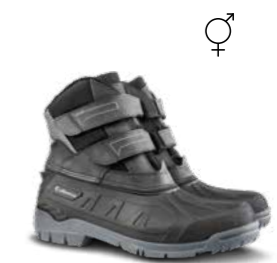
58.902.0 ONTARIO LINED VELCRO BOOT Sizes: 36 - 47