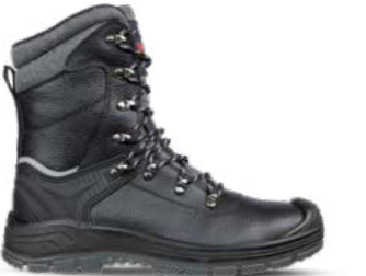
63.183.1 NORDIC HIGH S3 CI SRC Sizes: 39 - 47