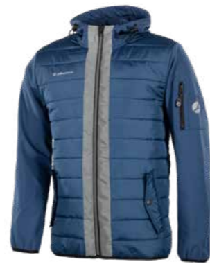
26.708.0 TOSMAR // QUILTED / SOFTSHELL JACKET S - 3XL