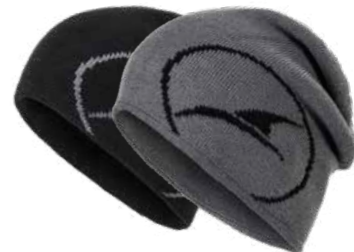
25.522.0 FREEZEGUARD // KNITTED CAP ONLY IN ASSORTMENS: 10 PIECES/COLOUR