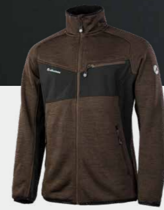
26.433.0 CONCEPT KNIT // RECYCLING JACKET S - 3XL