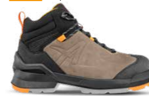
63.802.0 TARAVAL BROWN MID S3L ESD FO SR Sizes: 36 - 47