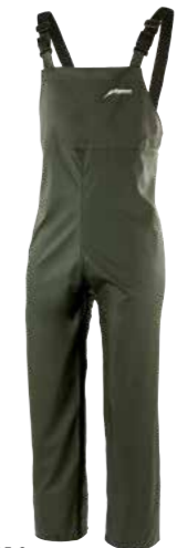
27.445.0 FAHRENHEIT LAZHOSE // PU-STRETCH-DUNGAREES S - 3XL