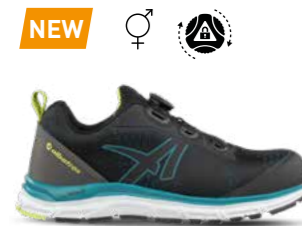
64.750.2 AER55 IMPULSE BLACK BLUE QL LOW S1P ESD HRO SRA Sizes: 36 - 47