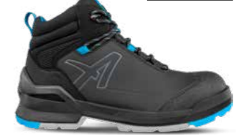
63.804.0 TARAVAL BLACK/BLUE MID S3L ESD FO SR Sizes: 36 - 50