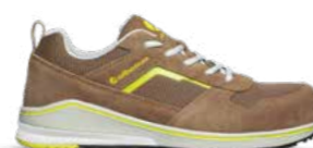
64.761.0 COURT SAND LOW S1P ESD HRO SRC Sizes: 39 - 48