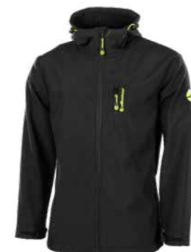
26.468.0 LAWRENCE // SOFTSHELL JACKET S - 3XL