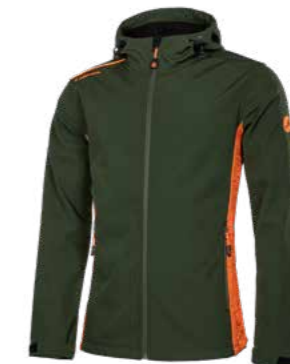
26.472.0 LISTER // SOFTSHELL / KNITTED JACKET S - 3XL