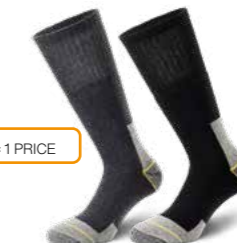
2 PAIRS = 1 PRICE 24.037.0 TEMPO DUO // LONG SHAFT WORKER SOCK Sizes: 39/42, 43/46