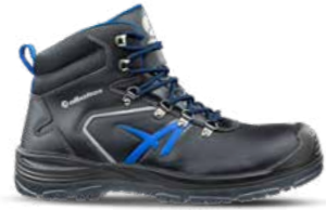
63.186.1 UNIT BAU MID S3 SRC Sizes: 39 - 47