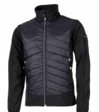
26.704.0 BRADLEY // HYBRID JACKET S - 3XL