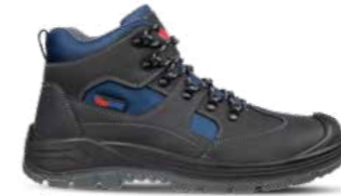
63.184.0 SAFE MID S3 SRC Sizes: 39 - 47