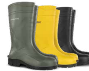
59.025.0 PROTECTOR PLUS S5 SRC SAFETY BOOT Sizes: 39 - 48