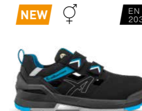
64.806.0 FORGE AIR BLACK/BLUE LOW S1 ESD FO SR Sizes: 36-50