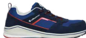
64.764.0 COURT BLUE LOW S1P ESD HRO SRC Sizes: 39 - 48