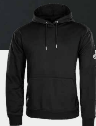
26.418.0 HAWLEY // HOODIE S - 3XL