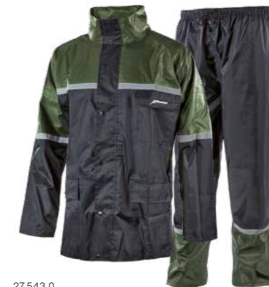
27.543.0 SUPERCELL // RAIN SUIT S - 3XL