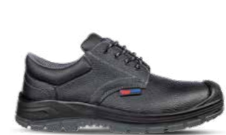
64.185.0 SOLID LOW S3 SRC Sizes: 37 - 47