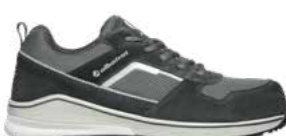
64.763.0 COURT GREY LOW S1P ESD HRO SRC Sizes: 39 - 48