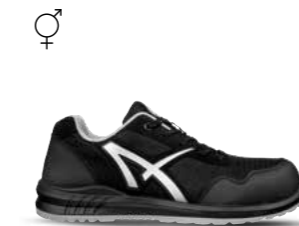
64.877.0 DRIFTER BLACK LOW S1P SRC Sizes: 36 - 47