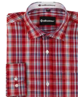
29.051.0 BRONZE 1/1 // LONG SLEEVE SHIRT 39/40 - 47/48