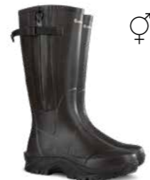
57.605.0 ARAGON NATURAL RUBBER BOOT Sizes: 39 - 47