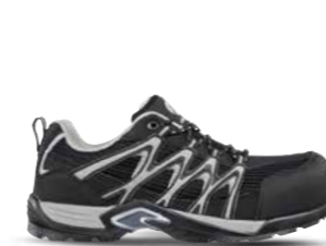
64.139.0 SILVER RACER XTS LOW S1P HRO SRC Sizes: 39 - 47