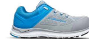
64.670.0 LIFT GREY IMPULSE LOW S1P ESD HRO SRA Sizes: 38 - 47