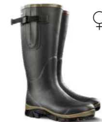
57.553.0 FOREST ISO NATURAL RUBBER BOOT Sizes: 37 - 47