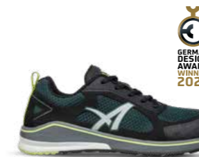
64.765.0 AER58 GREEN LOW S1P ESD HRO SRC Sizes: 39 - 48