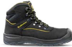
63.133.0 GRAVEL MID S3 SRC Sizes: 39 - 47