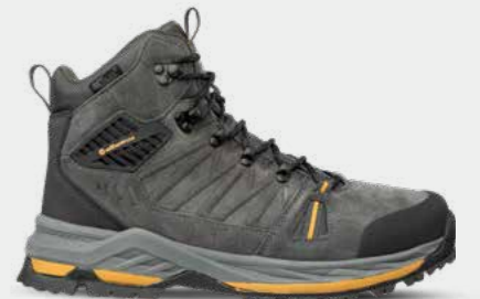
67.647.0 TERANO GREY CTX MID Sizes: 36 - 46