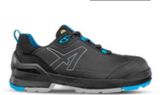
64.803.0 TARAVAL BLACK/BLUE LOW S3L ESD FO SR Sizes: 36 - 50