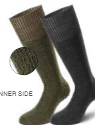
SOFT INNER SIDE 24.090.0 THERMO CONTROL LG // LONG SHAFT BOOT SOCK Sizes: 39/41, 42/44, 45/47, 48/52