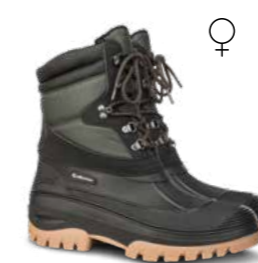
58.112.0 HUDSON LINED LACED BOOT Sizes: 36 - 47