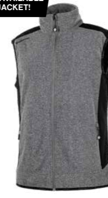
27.993.0 KERRY // FLEECE VEST S - 3XL