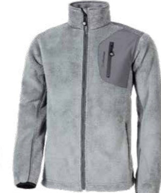
26.234.0 PILE // KNITTED/ FLEECE JACKET S - 3XL