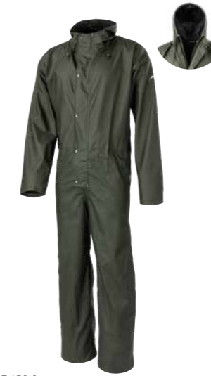
27.453.0 FAHRENHEIT OVERALL // PU-STRETCH-RAIN OVERALL M - 3XL