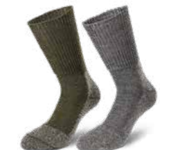
24.140.0 GUARD // WORKER SOCK Sizes: 39/41, 42/44, 45/47