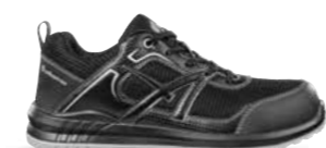
64.879.0 RIDER BLACK LOW S1P ESD SRC Sizes: 36 - 47