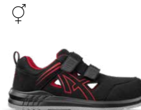
64.878.0 CLIFTON AIR LOW S1 ESD SRC Sizes: 36 - 47