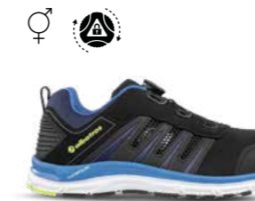
64.752.8 BREEZE IMPULSE QL LOW S1P ESD HRO SRA Sizes: 36 - 47