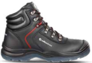
63.108.0 GRAVITATION MID S3 SRC Sizes: 39 - 48