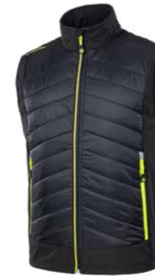
27.704.0 COOPER // HYBRID-VEST S - 3XL