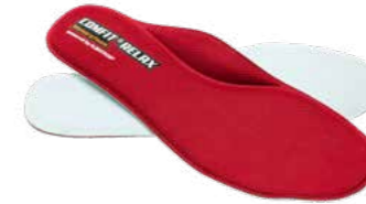
20.480.0 COMFIT®RELAX MEMORY FOAM FOOTBED