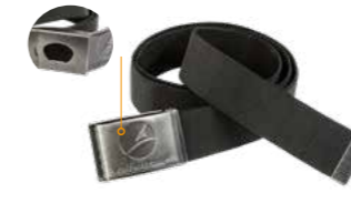
23.106.0 PADDOCK FLEX // BUCKLE BELT 120 cm (cut-to-fit)