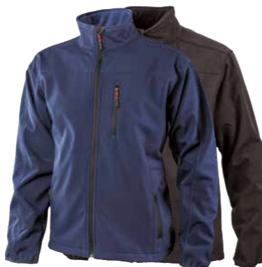
26.371.0 KEPLER // SOFTSHELL JACKET S - 3XL