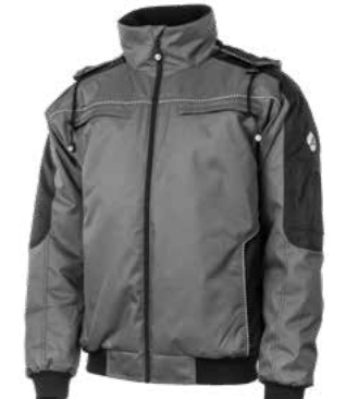
YKK CORDURA 28.660.0 EXPERT 360° // PILOT JACKET S - 3XL