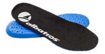
20.475.0 COMFIT®AIR FOOTBED