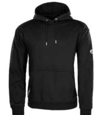
26.418.0 HAWLEY // HOODIE S - 3XL