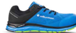
64.661.0 LIFT BLUE IMPULSE LOW S1P ESD HRO SRA Sizes: 39 - 47