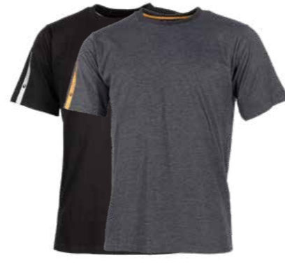
29.804.0 CORBET // T-SHIRT S - 3XL