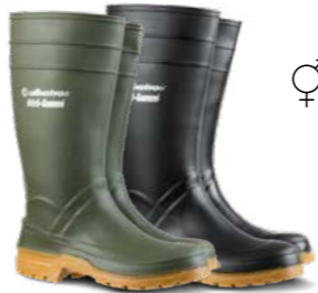
56.401.0 | 56.403.0 GUARDIAN HIGH GREEN | BLACK NITRILE RUBBER BOOT Sizes: 36 - 48