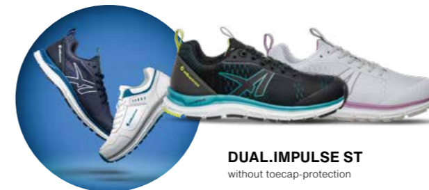
DUAL.IMPULSE ST without toecap-protection