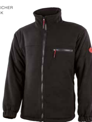
26.273.1 POLAR // WARMFLEECE-JACKET S - 4XL