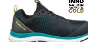
64.750.0 AER55 IMPULSE BLACK BLUE LOW S1P ESD HRO SRA Sizes: 36 - 47