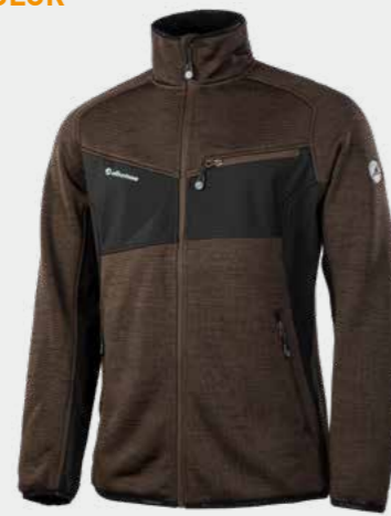
26.433.0 CONCEPT KNIT // KNITTED/SOFTSHELL JACKET Sizes: S - 3XL