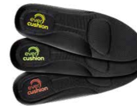
20.485.0 EVERCUSHION® CUSTOM FIT FOOTBED

Colours: LOW red (500), MID green (600), HIGH yellow (700) Sizes: 35 - 49