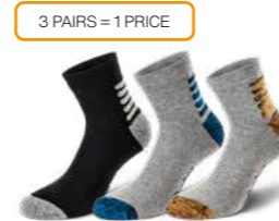
3 PAIRS = 1 PRICE 24.036.0 CONTROL TRIO // SNEAKER-WORKER SOCK Sizes: 39/42, 43/46