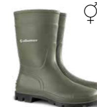
59.308.0 THE RANCHER PVC BOOT Sizes: 37 - 47