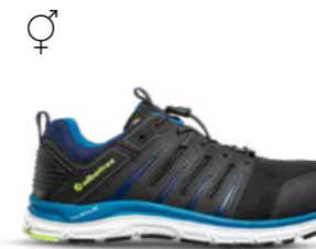
64.752.0 BREEZE IMPULSE LOW S1P ESD HRO SRA Sizes: 36 - 47