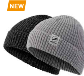
NEW 25.527.0 CLAY // KNITTED CAP ONLY IN ASSORTMENS: 10 PIECES/COLOUR