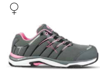
64.520.0 TWIST PINK WNS LOW S1PL ESD HRO SRC Sizes: 36 - 42