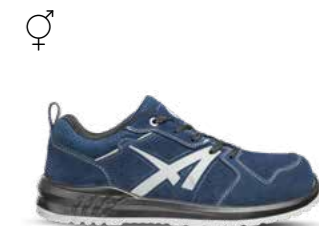
64.880.0 TWISTER DY NAVY LOW S1P ESD SRC Sizes: 36 - 47