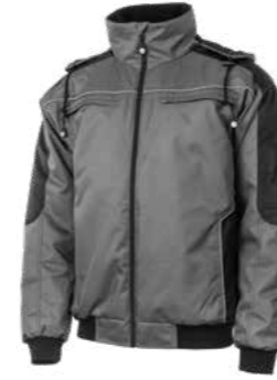
CORDURA YKK 28.660.0 EXPERT 360° // PILOT JACKET S - 3XL