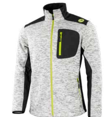
26.459.0 STIRLING // KNITTED SOFTSHELL JACKET S - 3XL