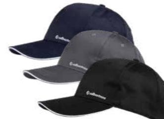
25.442.0 EASKY // BASEBALLCAP ONLY IN ASSORTMENS: 10 PIECES/COLOUR