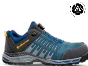
64.852.0 ANTELAO QL LOW S3 ESD HRO SRC Sizes: 40 - 47