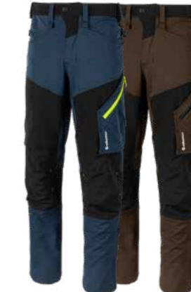
28.106.0 CONCEPT STRETCH TRS // STRETCH-TROUSER S - 3XL