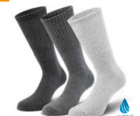
NEW 3 PAIRS = 1 PRICE 24.040.0 PROTECTION TRIO // WORKER SOCK Sizes: 39/42, 43/46