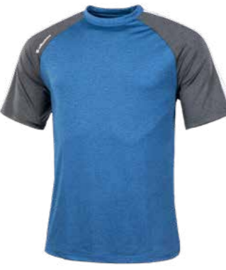
29.704.0 NAVAN // T-SHIRT S - 3XL