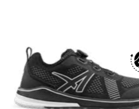
64.767.0 VOLTAGE BLACK QL LOW S1P ESD HRO SRC Sizes: 39 - 48