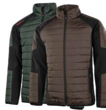
26.707.0 NARES // QUILTED JACKET S - 3XL