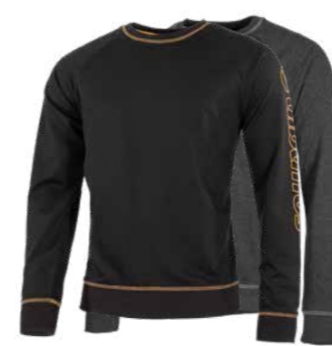
26.480.0 TYNAN // SWEATSHIRT S - 3XL