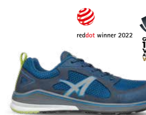
64.766.0 AER58 BLUE LOW S1P ESD HRO SRC Sizes: 39 - 48