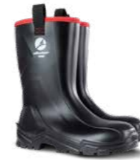
59.089.0 TITAN RIGGER S5 CI SRC PU-SAFETY BOOT Sizes: 39 - 49